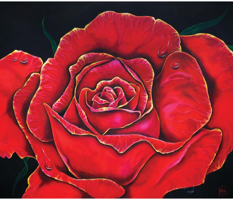
...BY ANY OTHER NAME, OIL ON CANVAS, 44 X 52"