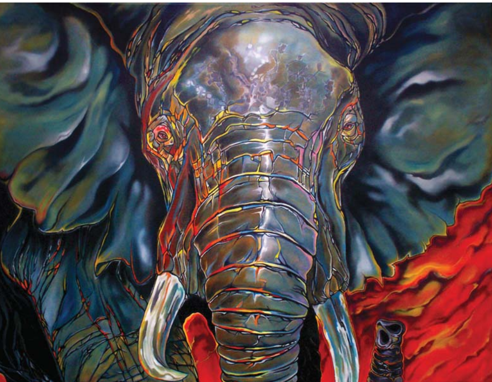
SERIOUS BUSINESS, OIL ON CANVAS, 42 X 52"